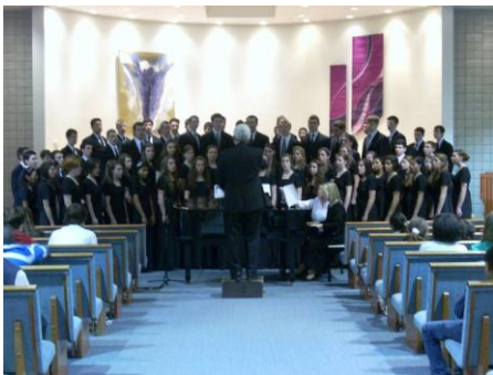
KA Choir on Tour in Maryland