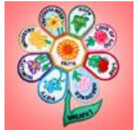
Little Flowers truly blossomed in their devotion to Jesus and the Blessed Mother

Our final meeting for the year will be a picnic at Watchung Reservation Park on June 13th. The girls have worked very hard and will have earned their entire Wreath I badges: Faith, Hope, Love of God, Love of Neighbor, Obedience, Piety, Humility, Industry and Truthfulness.