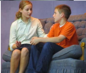
8 th Grade Performs “True Honor”